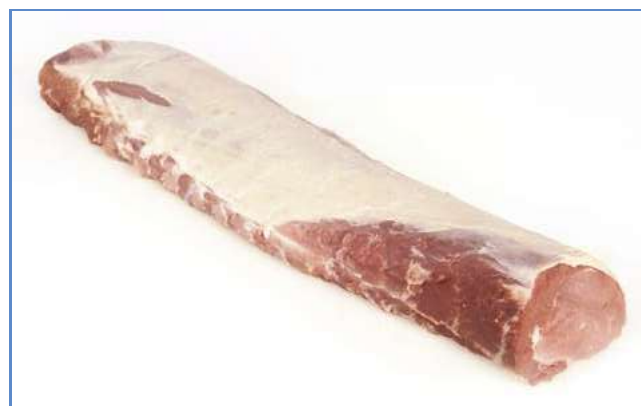
5 Loin Eye Muscle 95%, including silverskin, chain and spinalis muscle.