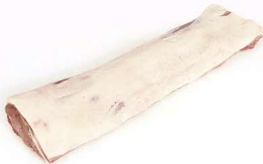
1 Loin of pork – boneless, rindless.