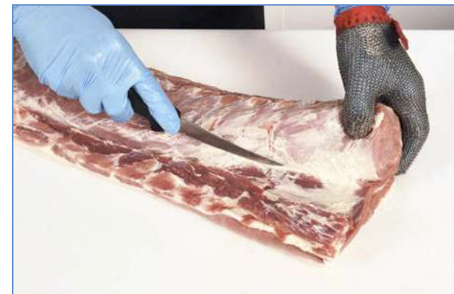
3 Follow the natural seams to remove the eye muscle from the remaining loin muscles including all back fat.