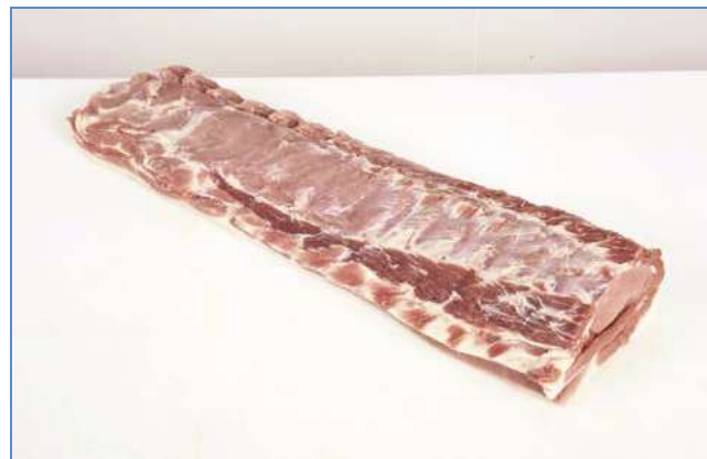
2 Loin of pork – boneless, rindless.