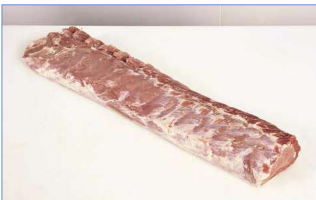
4 Taking care to leave the silverskin, chain and spinalis muscle on the loin eye muscle. Trim to 95%VL.